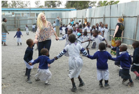
Missionaries from Chetek, WI

We are always grateful and awed by the graces and miracles of God every morning. Psalm 30:4-5 says, "Sing praise to the Lord, you saints of His, and give thanks at the remembrance of His holy name. For His anger is but for a moment, His favor is for life; weeping may endure for a night, but joy comes in the morning." We have lived this verse, enduring longer nights sometimes, but always lay our hope in the fact that He does come, and the morning does bring laughter.