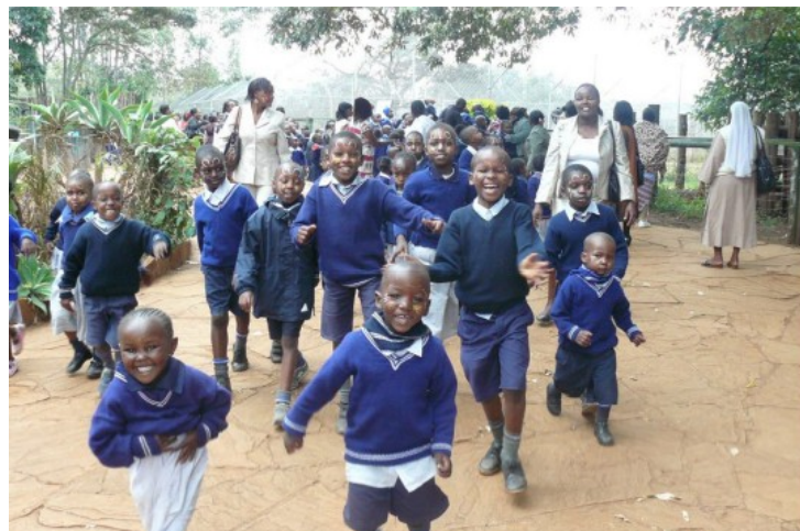
Happy to be away from school

We have had difficulty meeting the budget due to fluctuations in donations. We are requesting 50 monthly donors who would commit to donating $20 per month to keep a consistent flow of support. You can set up recurring donation via secure PayPal on our website or contact us and we can help you with the setup. Thanks you for your support.