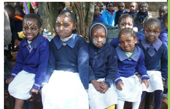
Field trip to Nairobi Animal Orphanage

1 st Christmas/ bonus party - This year we hope to host a Christmas party for Anchored Hope teachers, students, staff, and parents as well as have bonus packages for teachers who give of themselves to serve at the school at miniscule wages.